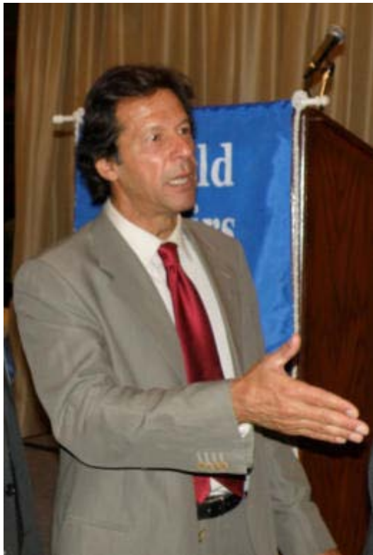
World Affairs Council of Houston

By SHAHZADA IRFAN HOUSTON CHRONICLE June 22, 2009, 11:07PM